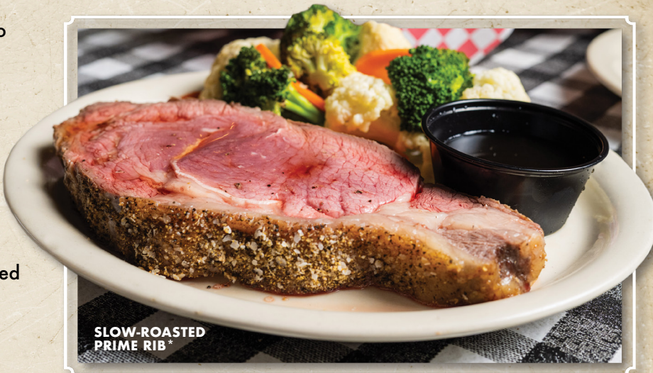
SLOW-ROASTED PRIME RIB*

12 OZ. ROADHOUSE CHOPPED STEAK* Fresh, daily-ground beef cooked your way and topped with sautéed onions. 15.99